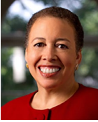
Dr. Beverly Daniel Tatum President Emerita Spelman College