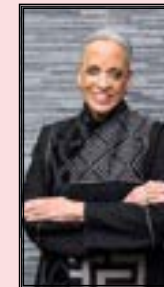
Dr. Johnetta B. Cole President Emerita, Spelman College

12:30 PM - 2:00 PM | New Presidents & Willa B. Players Lunch Plenary Robert W. Woodruff Library