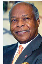
Dr. Louis W. Sullivan, President Emeritus, Morehouse School of Medicine; Former Secretary of Health & Human Services, & Chair of the HBCU ELI Advisory Board