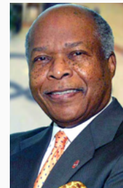
Dr. Louis W. Sullivan, President Emeritus, Morehouse School of Medicine; Former Secretary of Health & Human Services, & Chair of the HBCU ELI Advisory Board